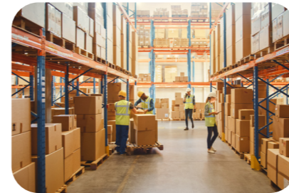
Manufacturing units & Warehouses

For more information, www.honeywellbuildings.in Call: 000-8000-502167 Email: HBT-IndiaBuildings@Honeywell.com